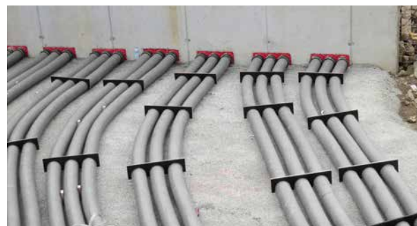
KMA and spiral hose Hateflex14150