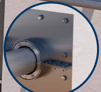
FAG with HSD