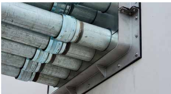
Stainless steel flange split for subsequent dowelling

*2 Solutions for further wall thicknesses > 200 mm available on request