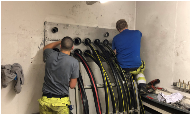
The split flange design allows the flange to be fitted to the existing cables. The electricity did not have to be switched off for installation, and no new cables had to be connected.