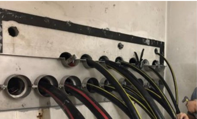
A solution involving flanges was selected, to seal irregularities in the core drills and duct, which are partly set in concrete flush with the inner wall.