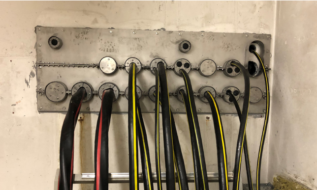
The cables are sealed against the socket with split press seals.