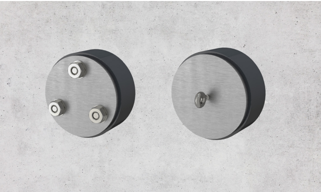
The blind seals have an eyelet on the inside, for attaching a pull cord.